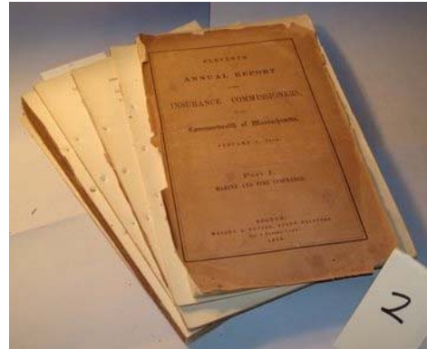
How it looked at the beginning

http://www.insurancelibrary.org/Adopt_a_Book.htm