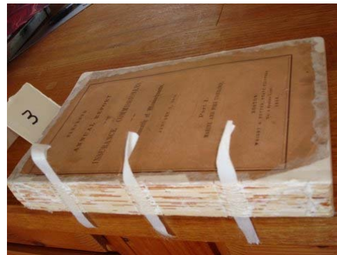
Repair in process