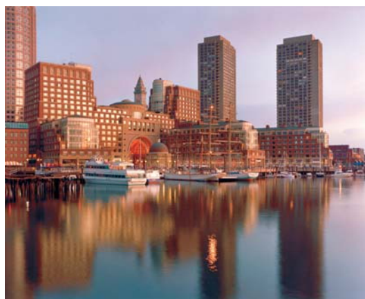
When you join us, you'll have the view looking out from the Wharf Room at the Boston Harbor Hotel (pictured)

Not to mention, of course, that the view from the Wharf Room is spectacular and the food is top quality!