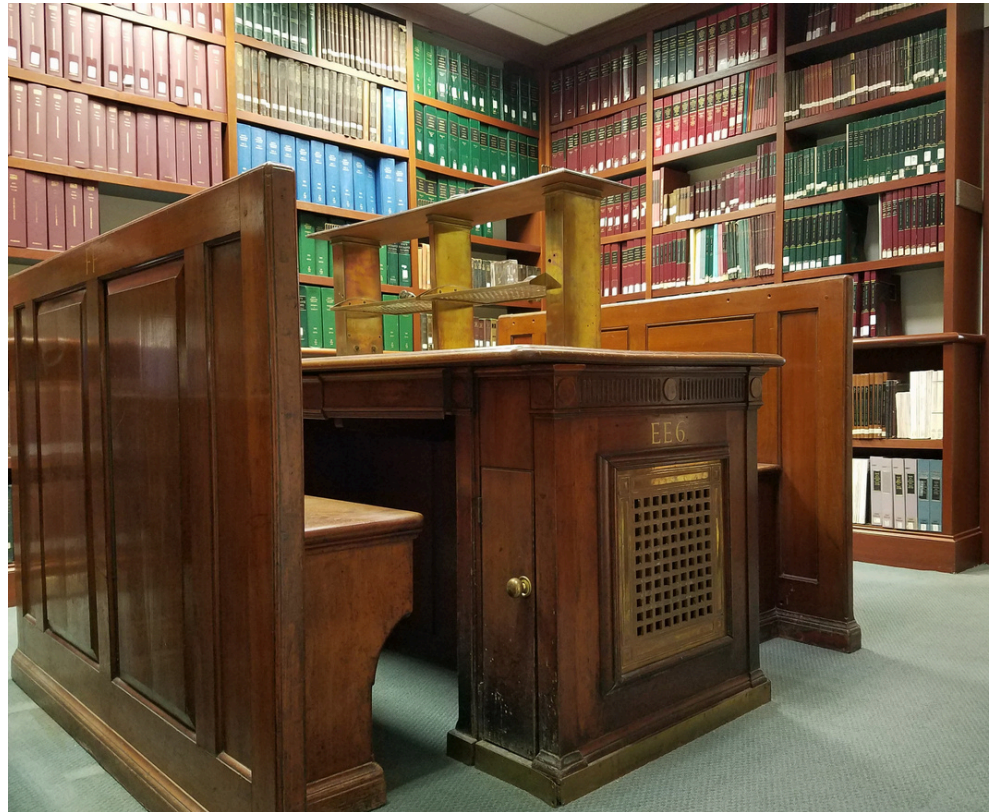
BROKER'S BOX FROM THE 1928 LLOYD'S BUILDING IN LONDON - DONATED TO THE LIBRARY IN 2014 BY WALLACE E. SISSON -