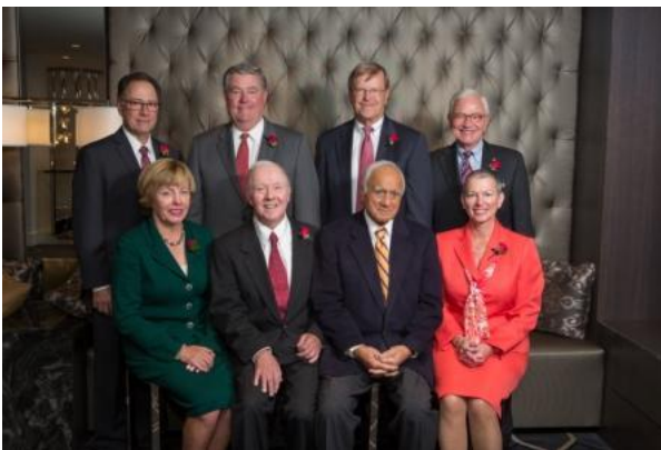
Insurance Professionals of the Year Winners

It's that time of year again and we want your nominations for the next Insurance Professional of the Year Award Winner!